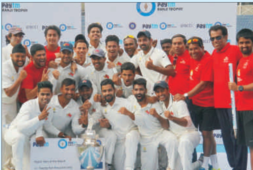
Mumbai Senior Team – Winners of Ranji Trophy 2015-16