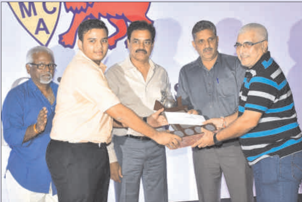
Runners Up of Kanga League 'A' Division 2015-16 – Payyade Sports Club