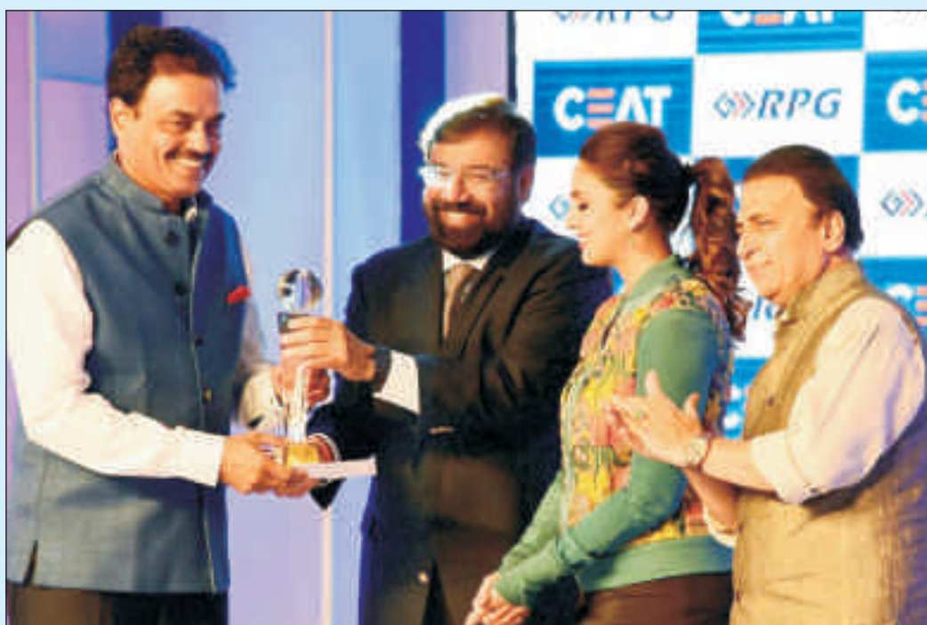
Mr. Dilip Vengsarkar receiving CEAT Lifetime Achievement Award