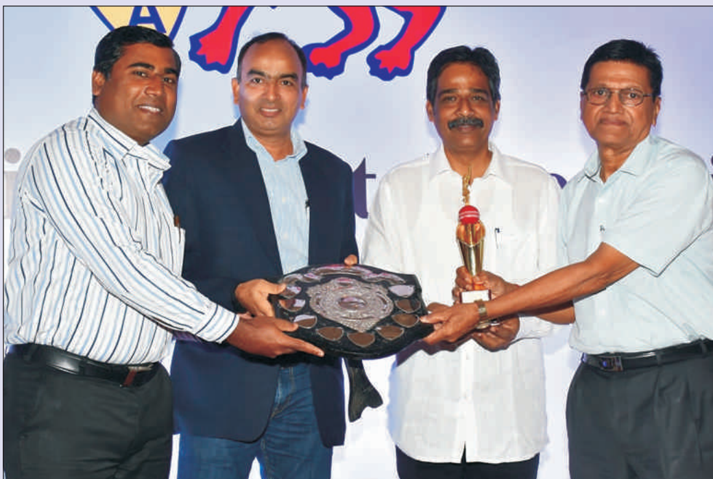
Winner of Kanga League 'G' Division (Summer Vacation Shield) 2014-15 Navi Mumbai Sports Association