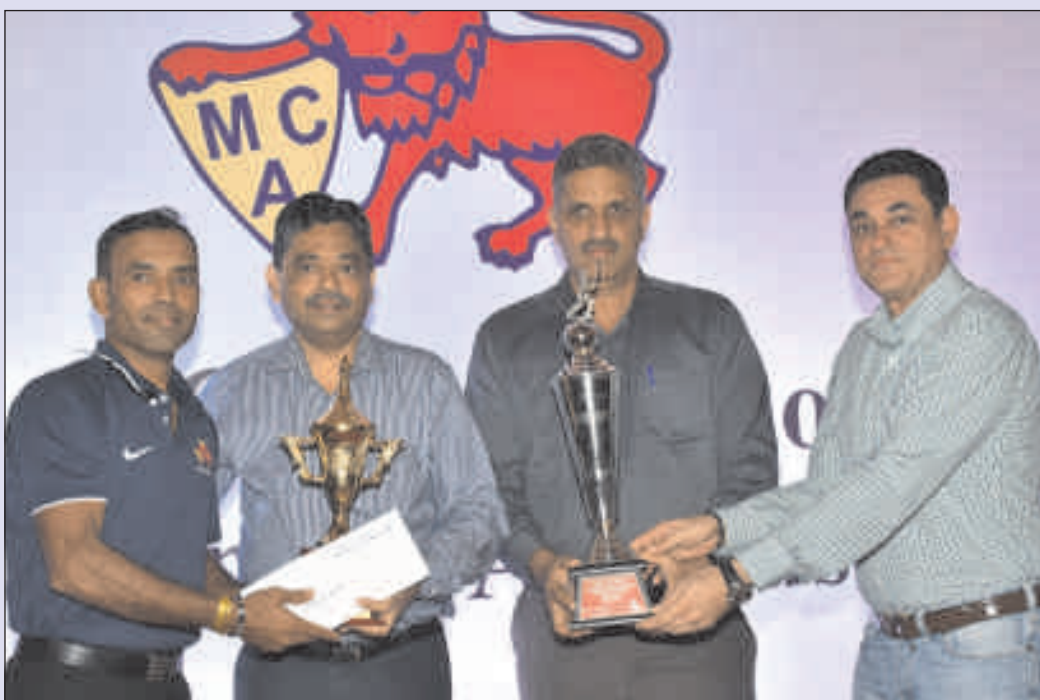
Runners Up of Kanga League 'A' Division (Police Shield) 2014-15 - Cricket Club Of India