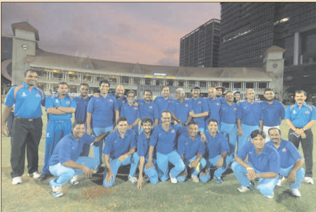
MCA Managing Committee Team and Media members during Inauguration of Flood Lights at Sharad Pawar Indoor Cricket Academy & Recreation Centre BKC.