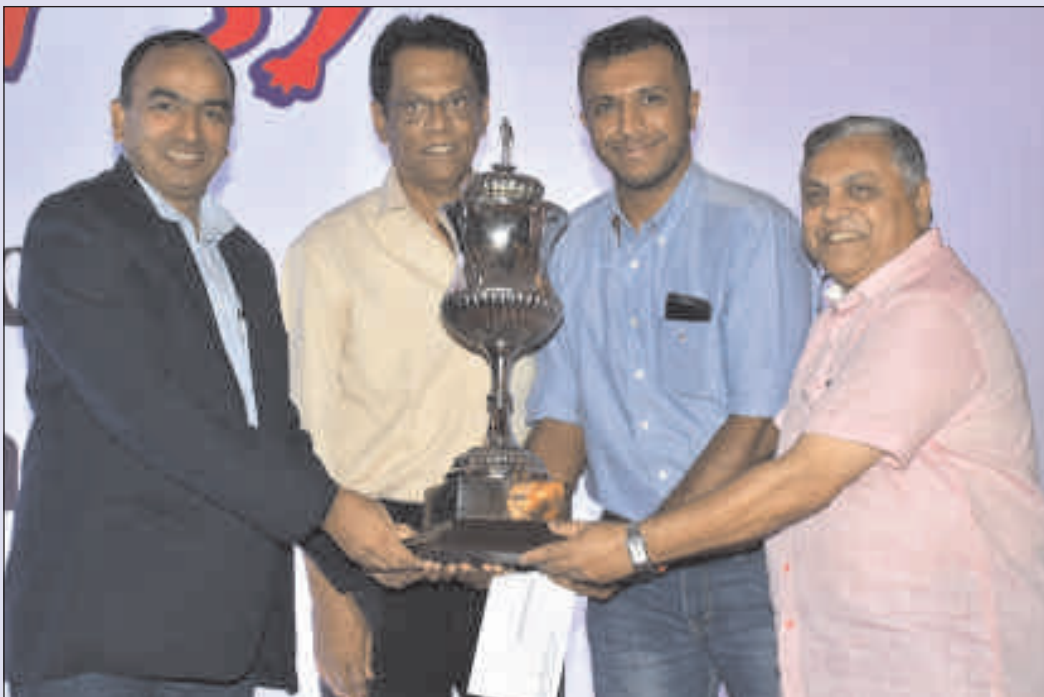
Runners Up of Kanga League 'D' Division (Salarjung Shield) 2014-15 Ghatkopar Jolly Gymkhana