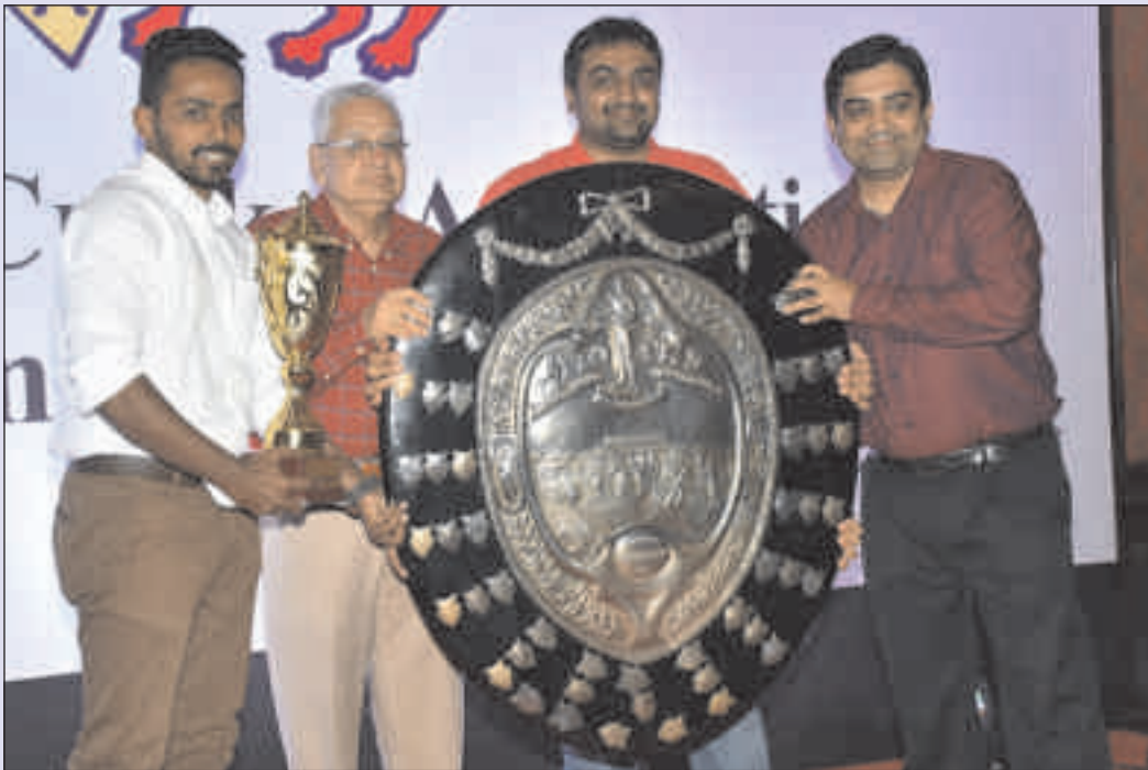
Winner of Kanga League 'B' Division (Purshottam Shield) 2014-15 - Parkophene Cricketers