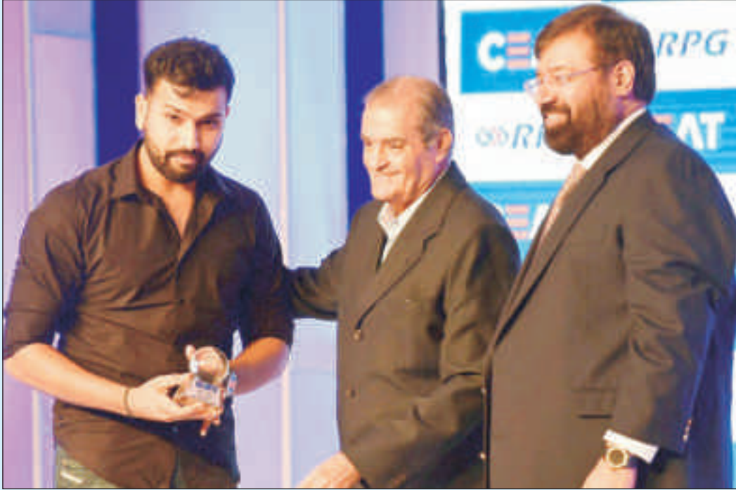
Mr. Rohit Sharma receiving CEAT Indian Cricketer Award for year 2015-16