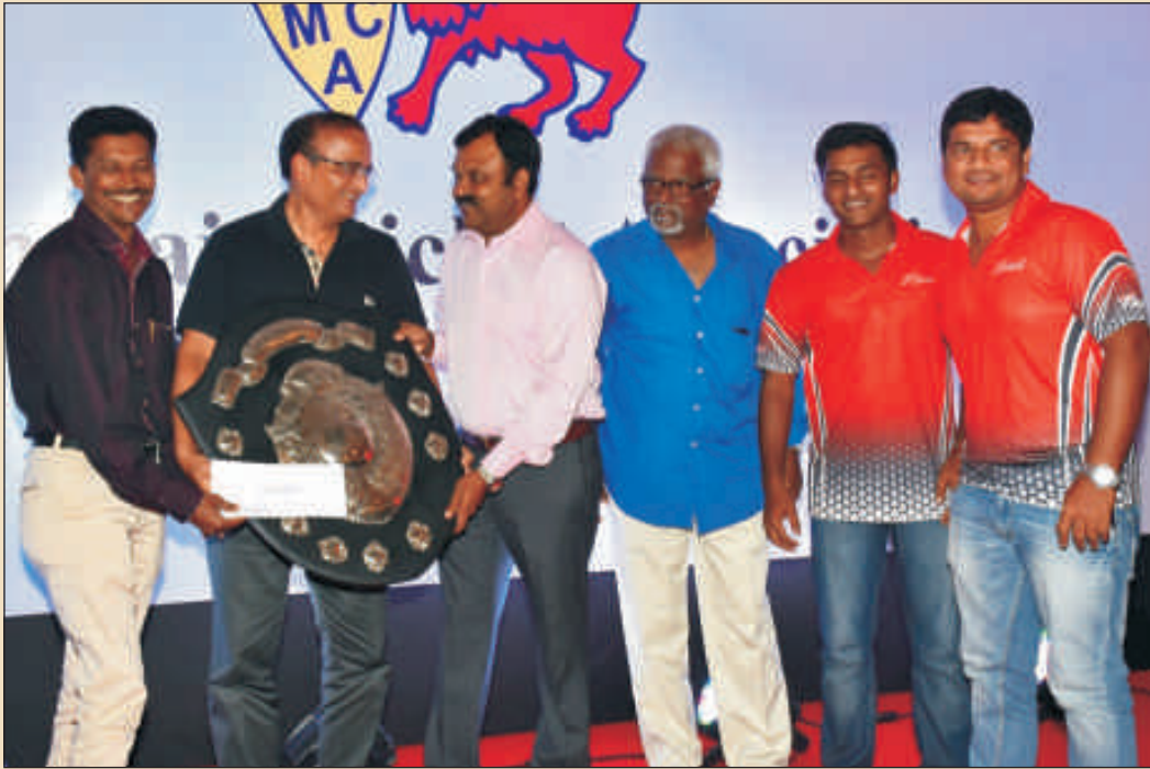
Winner of Kanga League 'C' Division 2015-16 – Maskati Cricket Club