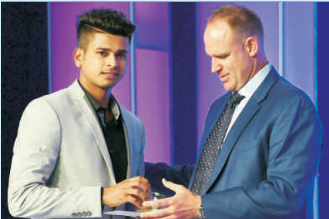
Mr. Shreyas Iyer receiving CEAT Domestic Cricketer Award for year 2015-16