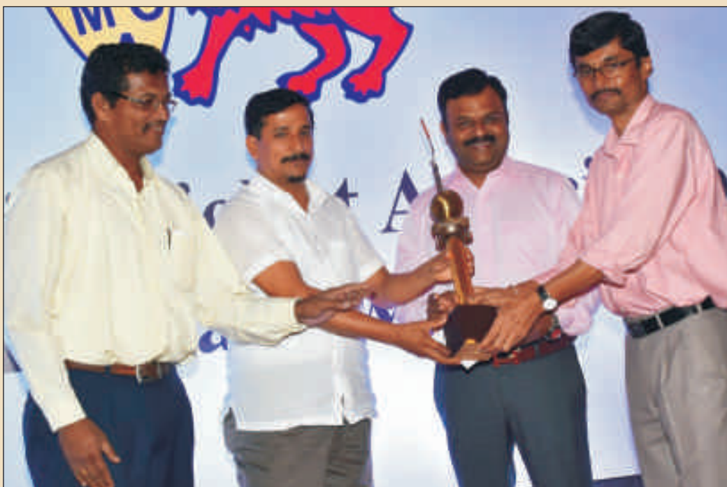
Winner of Kanga League 'G' Division 2015-16 – Achievers Sports Club