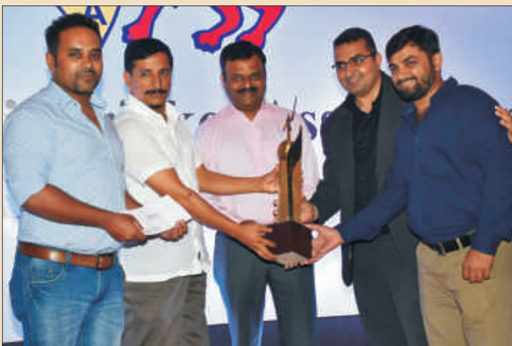
Winner of Kanga League 'F' Division 2015-16 – SKP Athletic Club