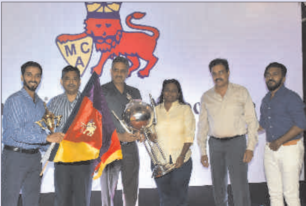
Winner of Kanga League 'A' Division (Police Shield) 2014-15 Dr. D.Y. Patil Sports Academy with MCA pennant