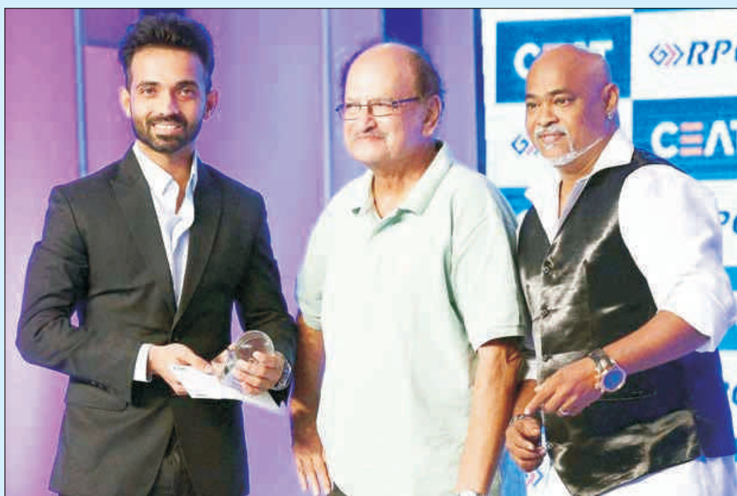
Mr. Ajinkya Rahane receiving CEAT Special Award for year 2015-16