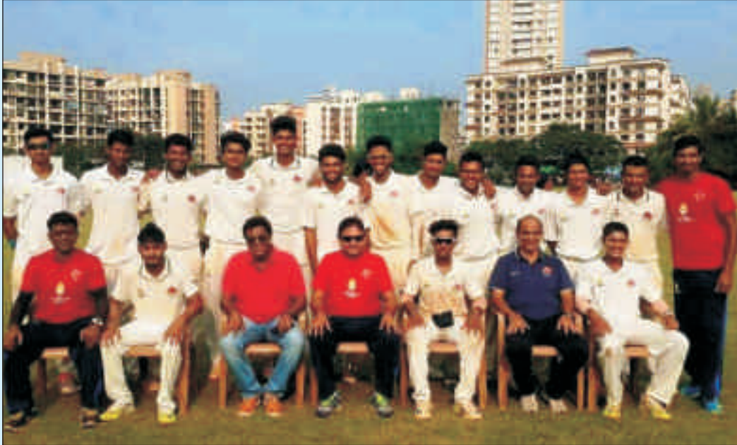
Mumbai U19 Team - Winners of U19 Vinoo Mankad Trophy (West Zone) 2015-16