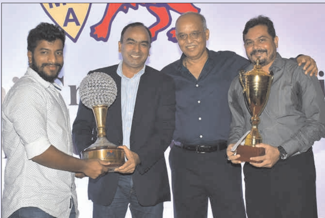
Runners Up of Kanga League 'C' Division (Young Comrade Shield) 2014-15 Bhatnagar Sports and Cultural Foundation