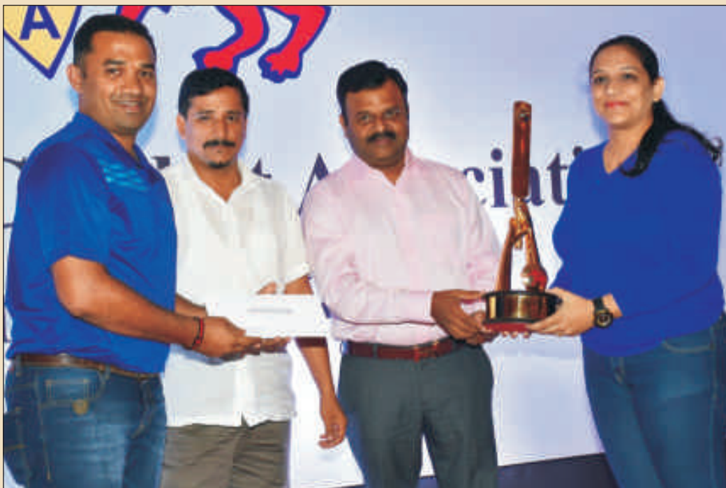
Runners Up of Kanga League 'F' Division 2015-16 - Pandurangwadi Cricket Club