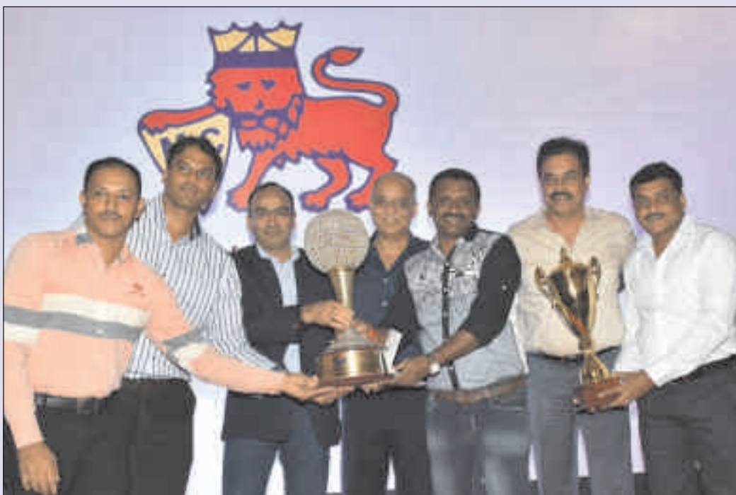
Winner of Kanga League 'C' Division (Young Comrade Shield) 2014-15 Dadar Union Sporting Club