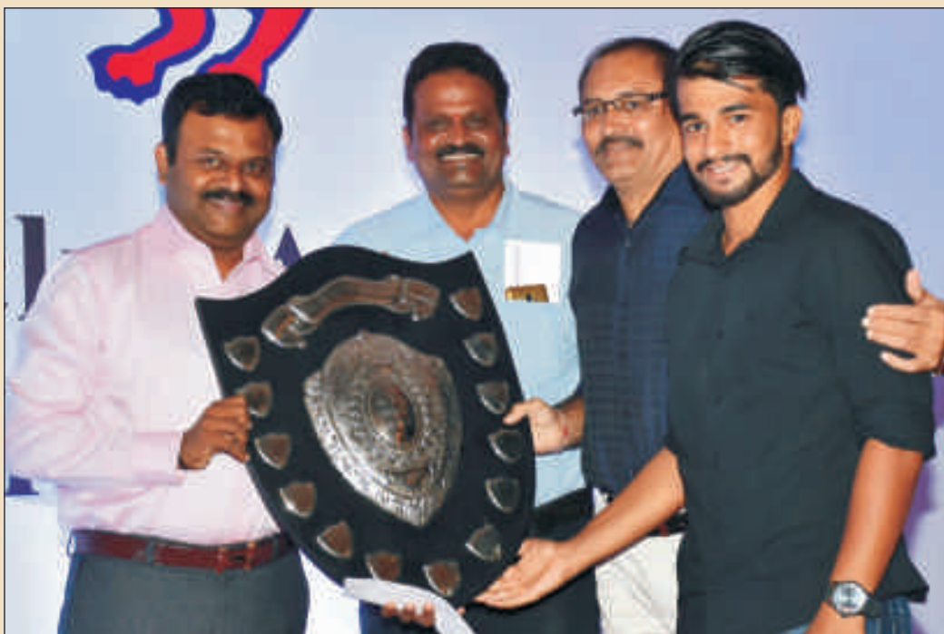
Winner of Kanga League 'D' Division 2015-16 – Young Comrade Cricket Club