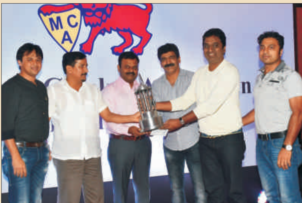
Winner of Kanga League 'E' Division 2015-16 – Goregaon Sports Club