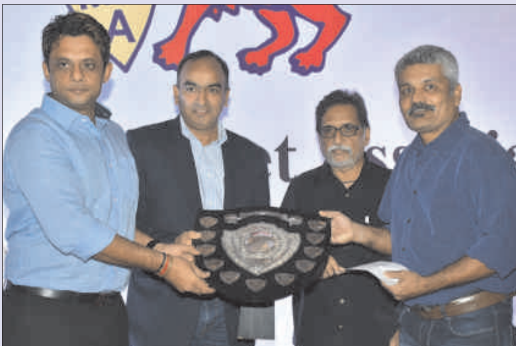
Winner of Kanga League 'E' Division (Cosmopolitan Shield) 2014-15 Juhu Vile Parle Gymkhana