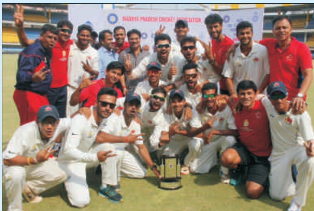
Mumbai U23 Team - Winners of U23 Col. C.K. Nayudu Trophy 2015-16