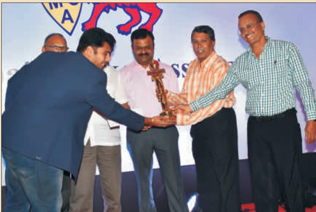
Runners Up of Kanga League 'E' Division 2015-16 – Prabhu Jolly Young Cricketers