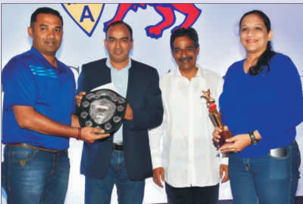
Runners Up of Kanga League 'G' Division (Summer Vacation Shield) 2014-15 Pandurangwadi Cricket Club