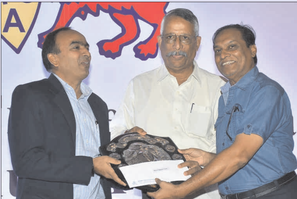
Runners Up of Kanga League 'F' Division (Mumbai Junior Shield) 2014-15 - Rizvi Sports Club