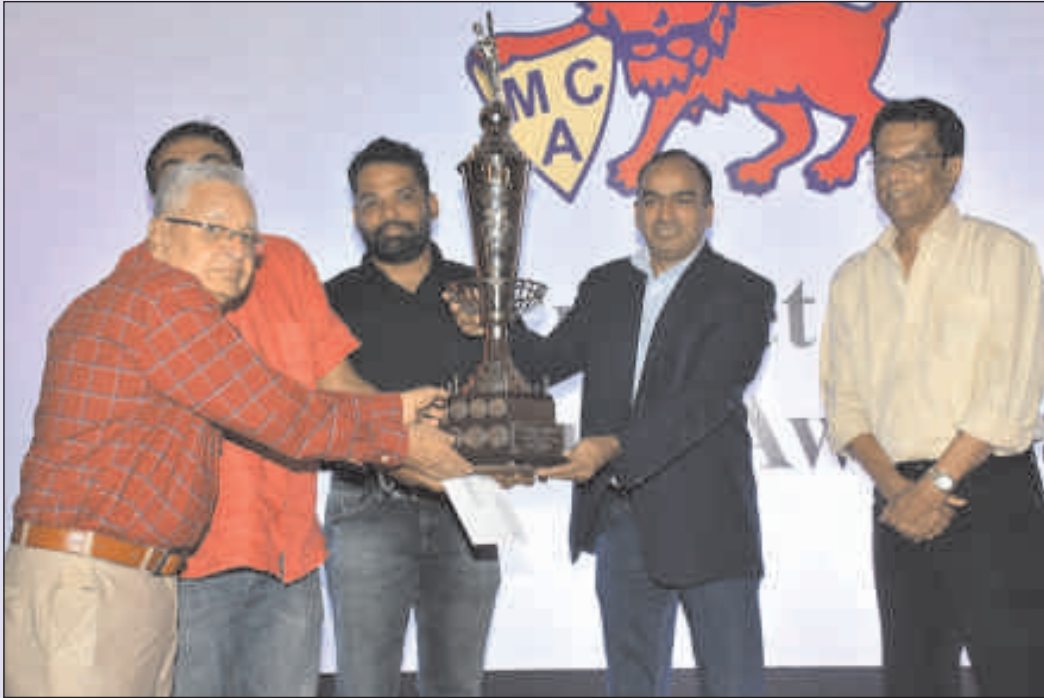
Winner of Kanga League 'D' Division (Salarjung Shield) 2014-15 - P. J. Hindu Gymkhana