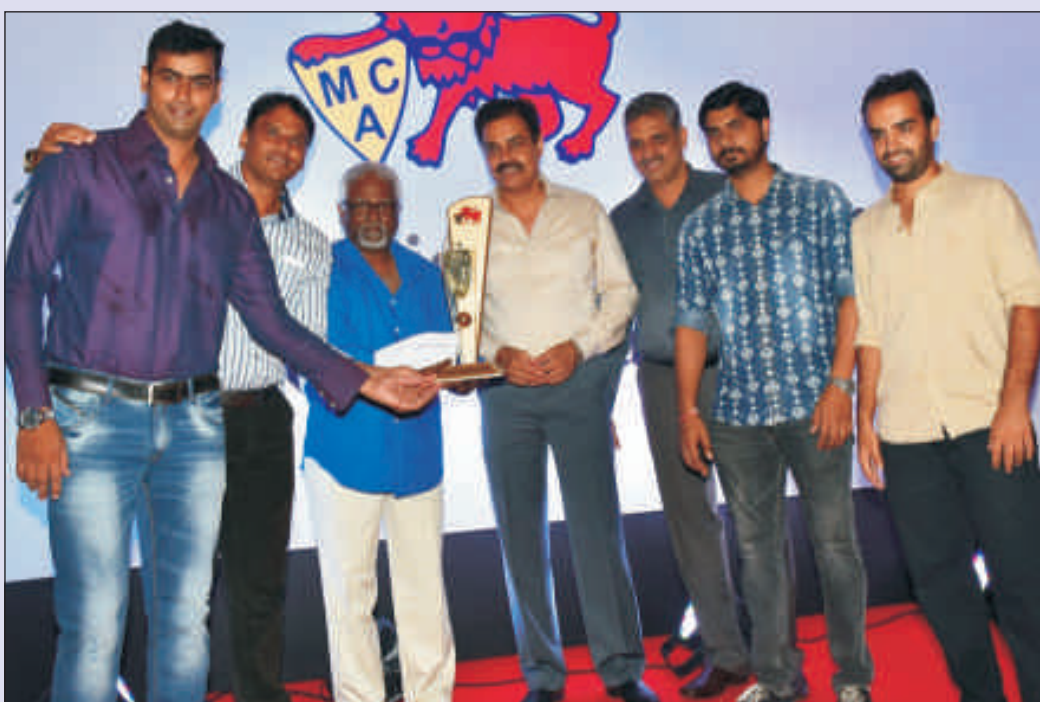
Runners Up of Kanga League 'B' Division 2015-16 - Dadar Union Sporting Club