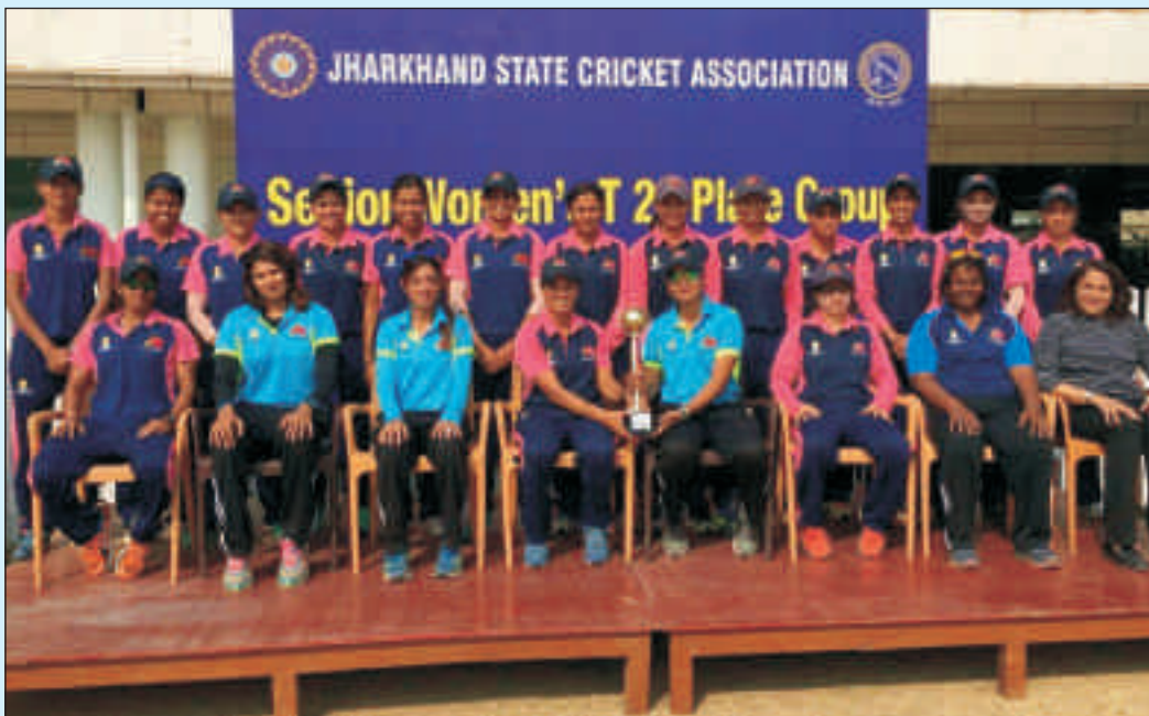
Mumbai Senior Women's Team - Winners of Senior Women's T20 (Plate Group) 2015-16