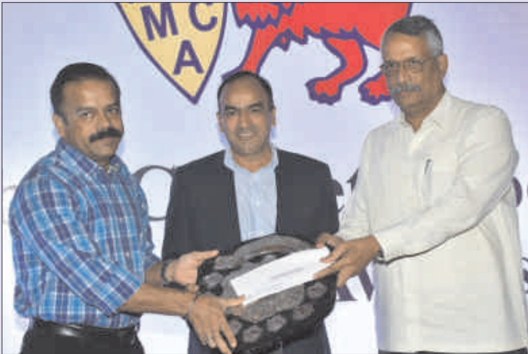
Winner of Kanga League 'F' Division (Mumbai Junior Shield) 2014-15 Canara Vijay Cricket Club