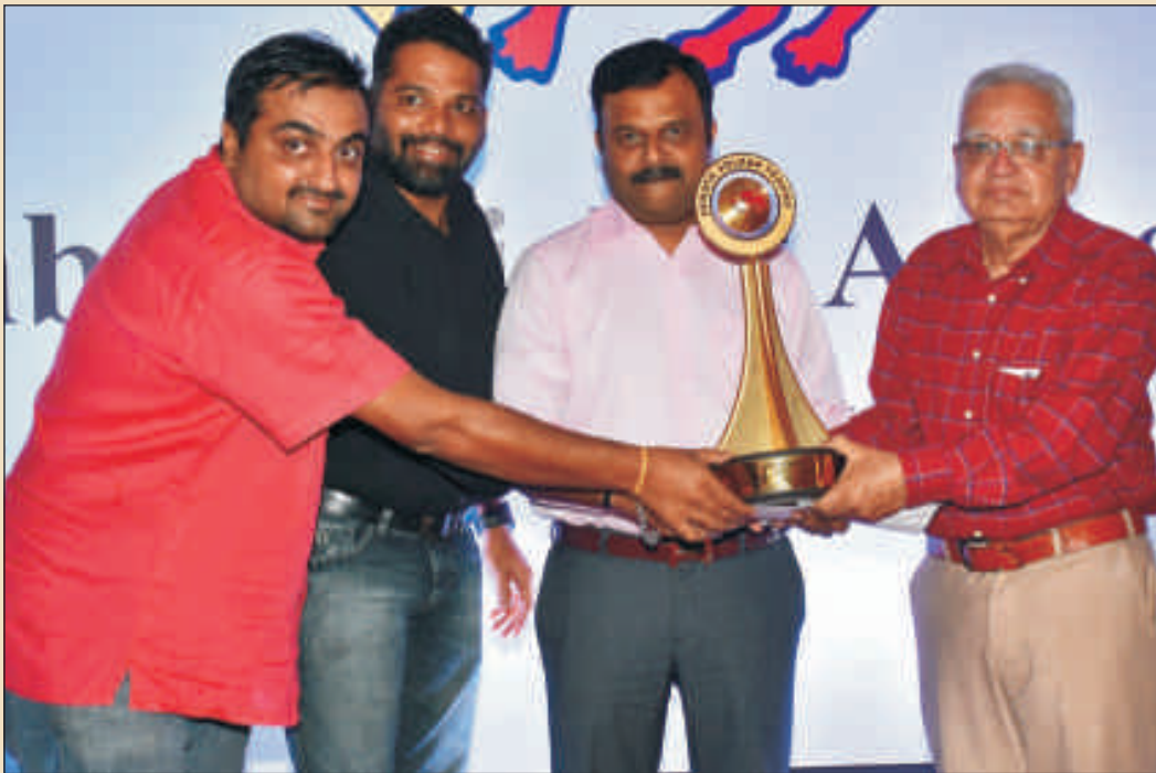
Runners Up of Kanga League 'C' Division 2015-16 – P.J. Hindu Gymkhana