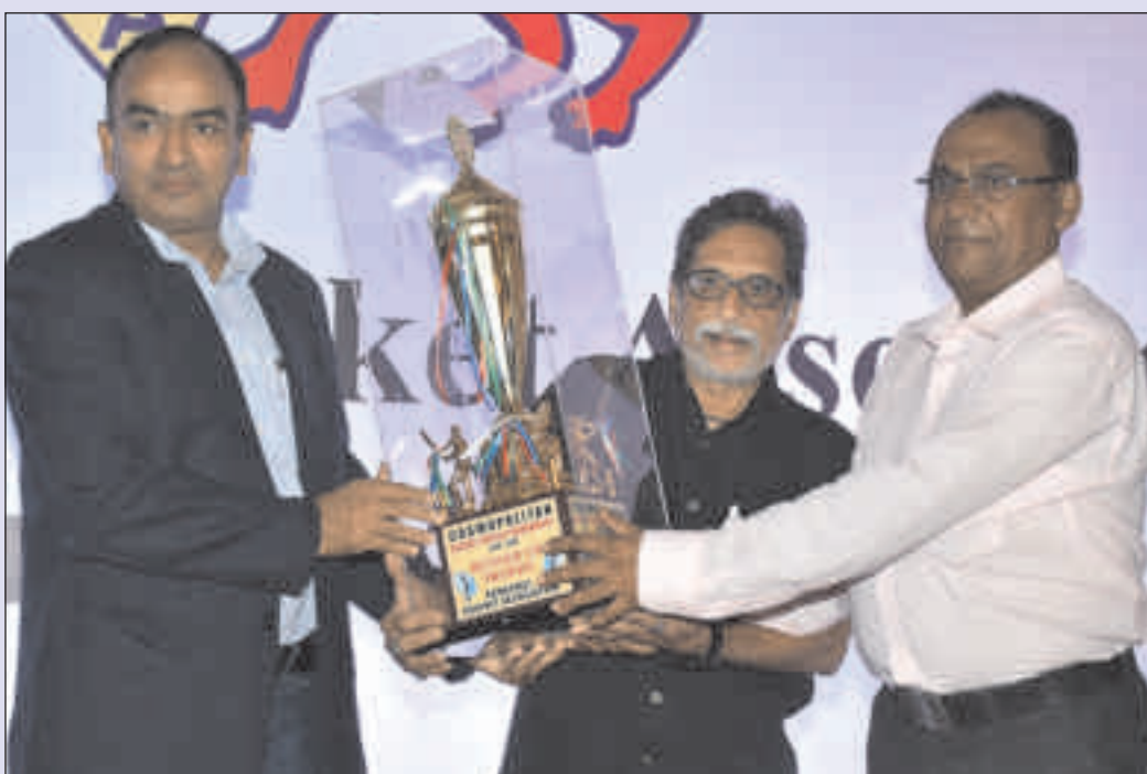
Runners Up of Kanga League 'E' Division (Cosmopolitan Shield) 2014-15 New Amrit Cricket Club