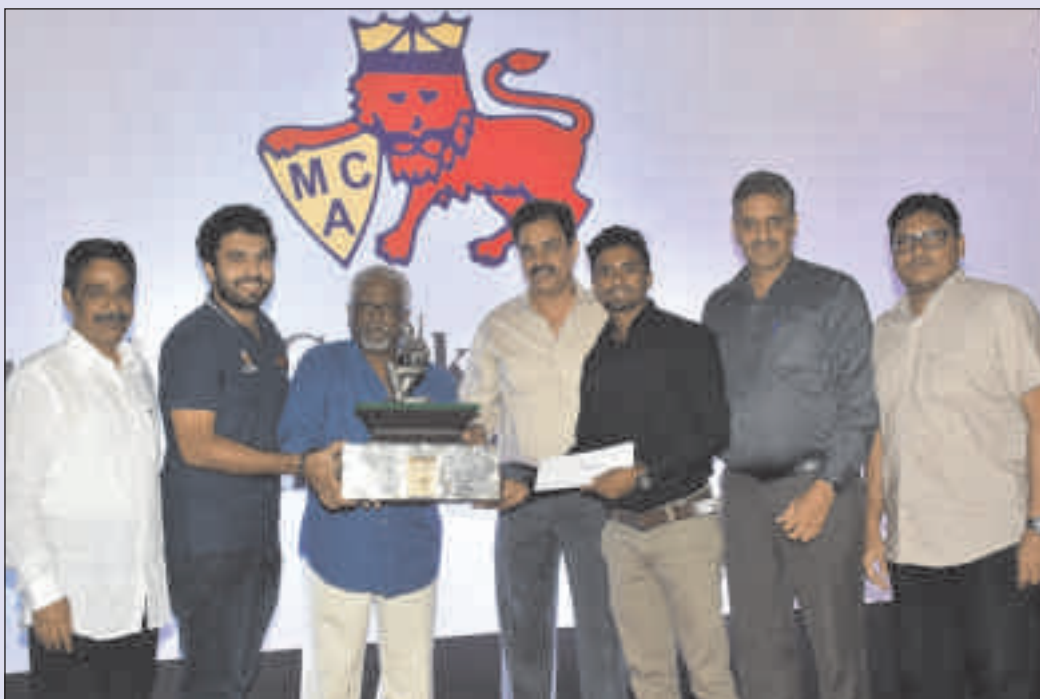
Winner of Kanga League 'B' Division 2015-16 – Sind Sports Club