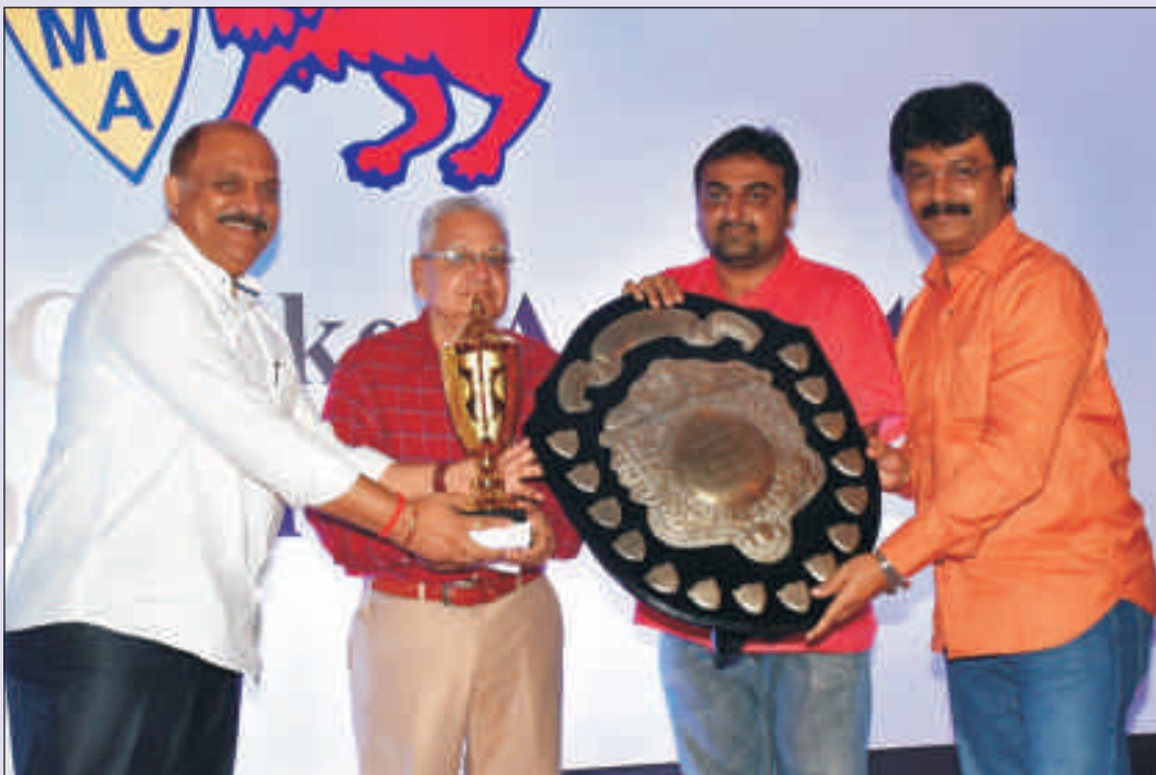
Runners Up of Kanga League 'B' Division (Purshottam Shield) 2014-15 - Sainath Sports Club