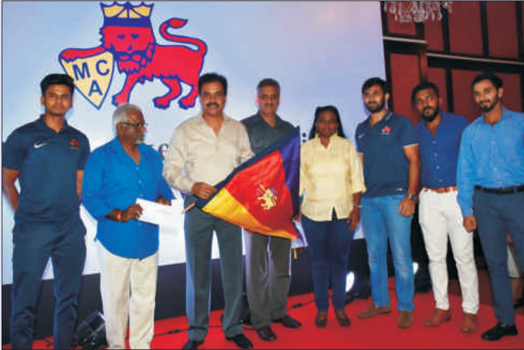
Winner of Kanga League 'A' Division 2015-16 - Dr.D.Y. Patil Sports Academy with MCA pennant